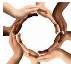
Sharing our gifts

The St. Peter’s Prayer Shawl Ministry meets twice a month on the first and third Fridays at 1:30 pm in the Luther Room.